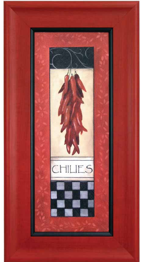
The red Colori frame from FramERICA echoes the heat from the chili pepper artwork. The Colori line features 15 profiles in seven colors. Matching fillets add to the versatility of the collection.

We will help you keep up with the latest trends or stay traditional—either way you can liven up a room—by using colorful frame designs in your home decor. Stop by and see us soon. ■