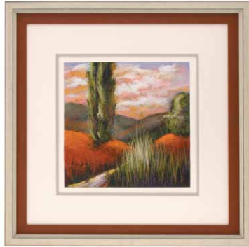
This colorful landscape is framed with metal on the inside and wood on the outside. Outer Frame: Nurre Caxton Moncada Collection. Inner Frame: Nielsen 41-E213 Coin Copper.

Texture and color are both important factors. Landscapes can look richer and brighter when the right color choice is used. Follow the texture of the art through to the frame design. Do you have a photographic print that will be enhanced by using its non-dominant color on both the metal and wood