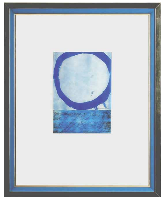
A blue moulding from the LeCirque Collection (Larson-Juhl) serves as a colorful liner in a dark Tresora Frame. It is a perfect complement for the "Jazz" art image.