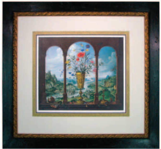
Inlays work with almost any style and add significant amounts of color without adding layers to a finished piece.

Don't let your artwork get lost. We can work with you to decide what design elements work best for your artwork and to show you how bigger mats can add more impact to their presentation. ■