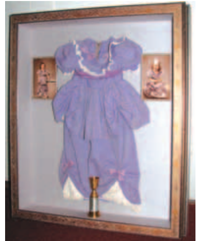
Precious childhood memories and keepsakes, like this baby dress and pageant trophy, can be preserved in the perfect setting.

Of course, when it comes to framing cherished objects, it is important to remember that less is more. We can help you choose key elements to include in a design. For example, framing the ticket, scorecard, program, ball, glove, and Cracker Jack box from your first baseball game may be a little overwhelming. Why not choose two or three elements to focus on. Your ticket and scorecard will capture the moment nicely. ■